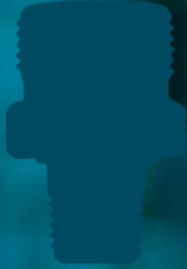
Screw fitting 1/4M x M22

Just put your coupler or fitting over the image to determine your needed size