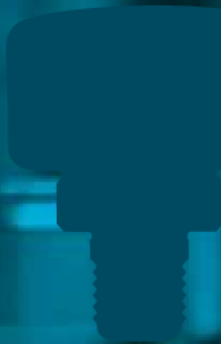
Screw coupler 1/4M x M22