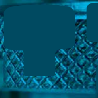
Screw coupler 3/8M x M22