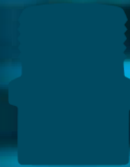
Screw fitting 1/8F x M22