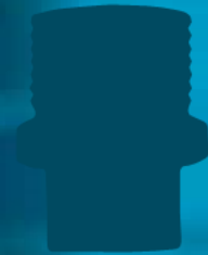
Screw fitting 1/4F x M22