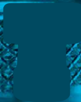
Screw coupler 3/8F x M22