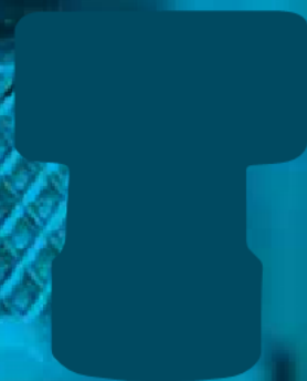
Screw coupler 1/4F x M22