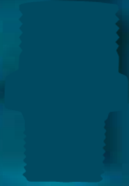
Screw fitting 3/8M x M22